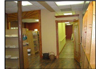
Store Greater, Maverick